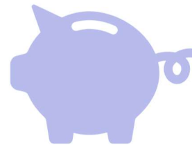
Ensure funding is used to support engagement (Staff rep only)