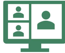
Engage with Navigation sessions