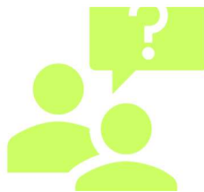
Support your student colleague (Staff rep only)