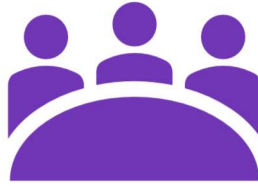
Engage with Discovery Days